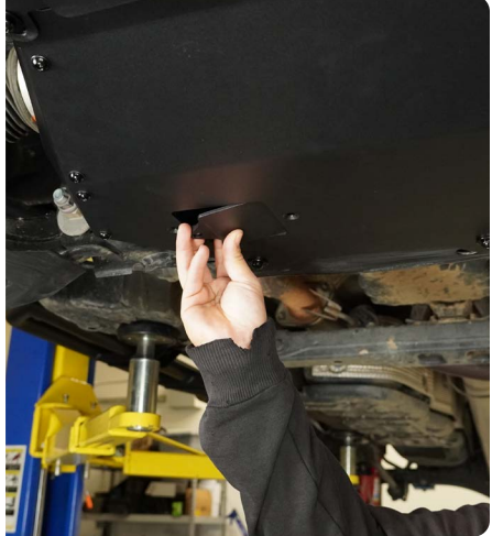
STEP 8 | Use the (2) provided M8x20 counter sunk Allen head bolts to secure the oil drain cut out plate in place.