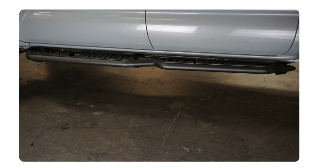
STEP 5 | Congratulations! You are finished with the install of the DV8 OE Plus Steps.

Repeat steps for the opposite side of the vehicle.